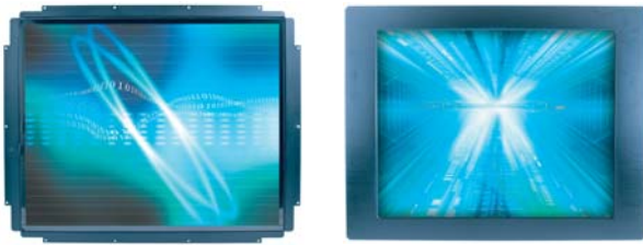
Open Frame Type